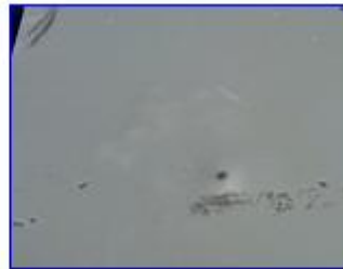
Sample2 Post Test Rear Side Closeup