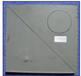
Sample2 Post Test Rear Side