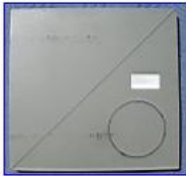
Sample2 Pre Test Impact Side