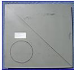
Sample2 Pre Test Rear Side