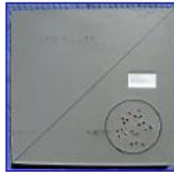
Sample2 Post Test Impact Side